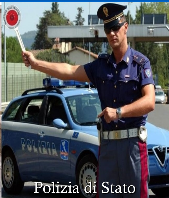
Polizia di Stato