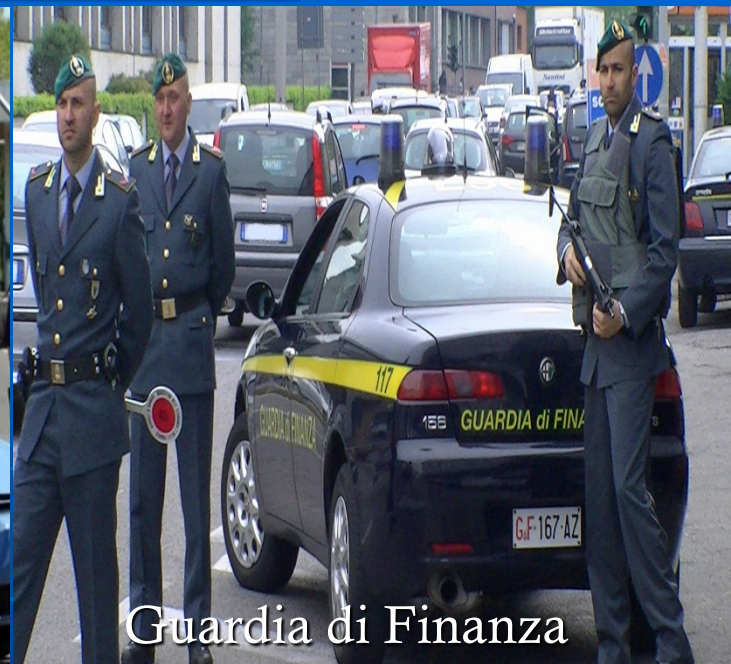
Guardia di Finanza